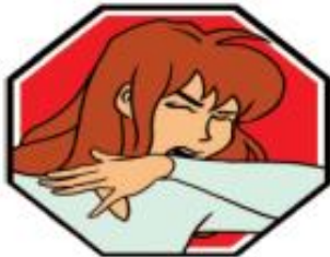
COVER MOUTH AND NOSE